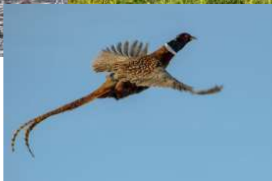
Flying ring-necked pheasant