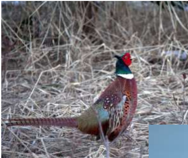
Ring-necked pheasant, photograph courtesy of JoAnne Dunphy

Hungarians are in low numbers to our knowledge, with our last numbers recorded in East Point and North Lake, if anyone sees any please give us a call as we would like to establish better numbers in our management area.